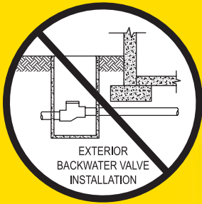
EXTERIOR BACKWATER VALVE INSTALLATION